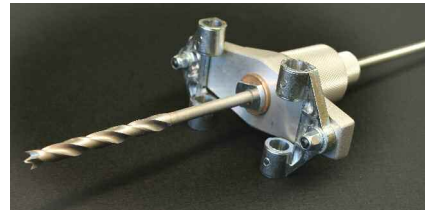
Long Drill Adapter installed on housing