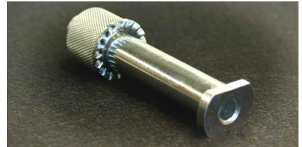
Long Drill Adapter

Leading in its field, the LONG DRILL KIT is quick, accurate and easy to use.