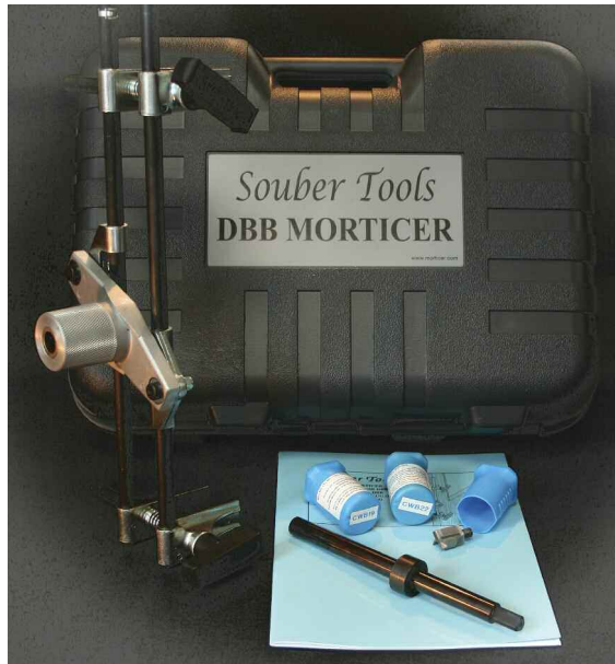
The complete Mortice Kit included in the price.

Our easy to follow instruction manual will help you get the best out of the DBB morticer with clear step-by-step illustrations.