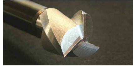
Aluminium Door Cutter

Four cutter sizes provide you with all the range you need to cut a lock slot in an aluminium door.